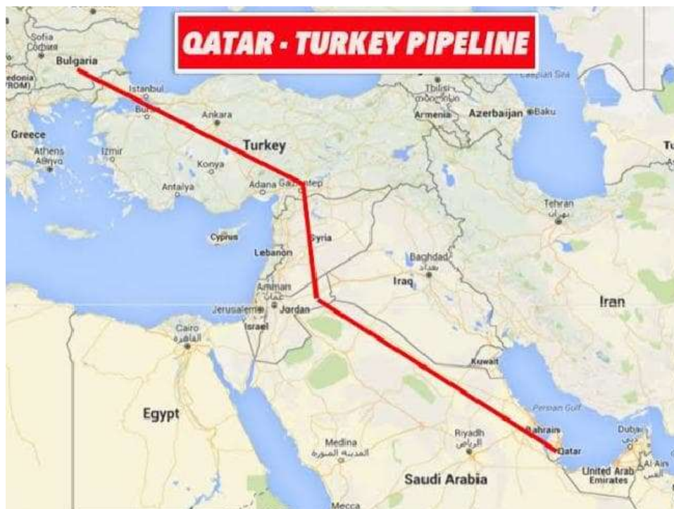
Above: U.S. backed pipeline from Qatar to southern Europe.