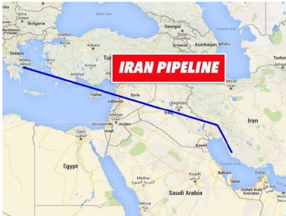
Above: President Putin’s contracted oil pipeline from Iran to southern Europe.

caught up together with them in the clouds to meet the Lord in the air. And so we will be with the Lord forever” (1 st Thessalonians 4:16–17)—are you ready for His coming for his Bride?