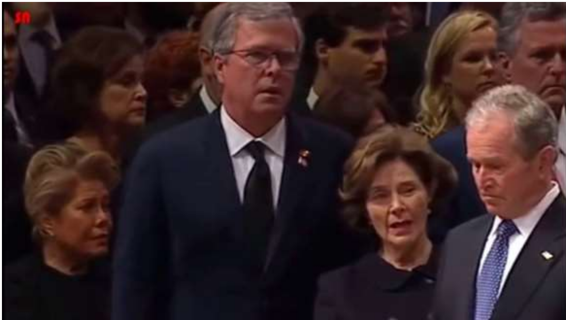
The three Bush family members showing undisguised shock after viewing the note received at their father's funeral.

It appears that Trump cannot speak to this catastrophe the same way that he could not speak to the Mandalay Bay massacre staged in Las Vegas by the globalists. Therefore, it may be that the coming storm will be a direct result of this California mass murder and malicious destruction of property statewide.