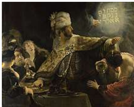
Rembrandt's 1635 painting Het feestmaal van Belsazar (Belshazzar's Feast) , collection of the National Gallery, London, UK

In the case of this "THE ENVELOPE AFFAIR", the writing was on each note. This biblical saying is pregnant with meaning, especially where it concerns the current and very delicate state of affairs in Washington, D.C. As follows: