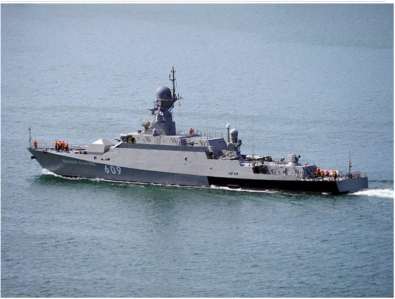
The Vyshny Volochek joined the Black Sea fleet on June 1<sup>st</sup>, 2018.

Russia's Latest Buyan-M Corvette Reinforces Russian Mediterranean Group. The latest guided missile corvette Vyshny Volochek (Buyan-M) is sailing to the Mediterranean Sea to join the Russian naval force at the Syrian coast, the Black Sea fleet said.