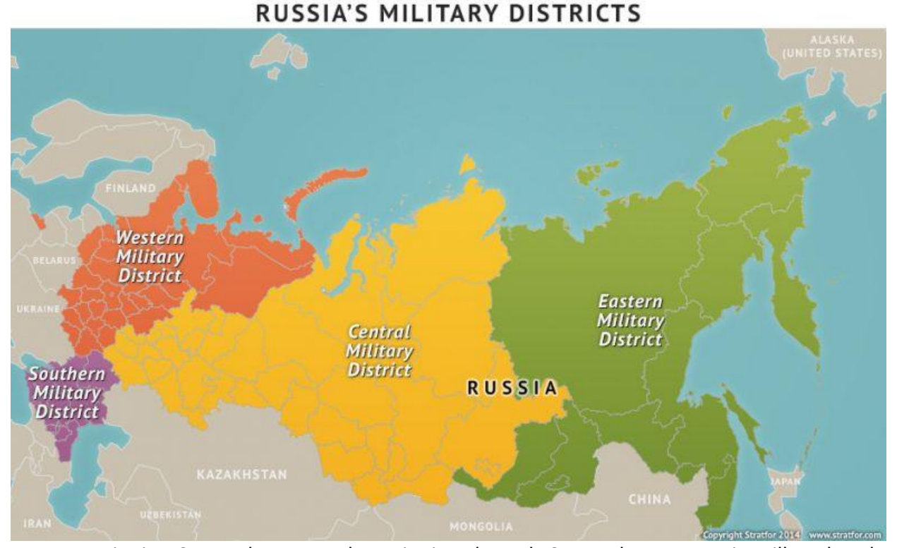
First as a frame of reference, here is a map showing the location of Russia's "Military Districts:"

Beginning September 11 and continuing through September 15 Russia will undertake the largest war games drill since 1981, named Vostok2018. Some 300,000 Russian troops, 1,000 aircraft, and over 900 Main Battle Tanks (MBT) are taking part.