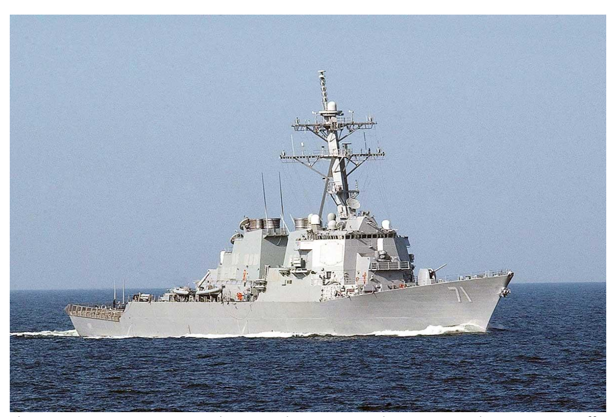
The US Navy Destroyer USS Ross has arrived on-station in the eastern Mediterranean Sea off the coast of Syria.

The TOW launcher is widely carried on various vehicles, and even helicopters. The launcher can be mounted on HMMWVs. It is employed as the main anti-tank weapon by M2 infantry fighting vehicle and M3 Bradley cavalry fighting vehicle. Also there are dedicated anti-tank missile carriers, based on the Stryker (M1134) and LAV-25 (LAV-AT). The M1134 is used by the US Army, while the LAV-AT is used by the US Marine Corps. Also there is an obsolete M901 anti-tank missile carrier, based on the M113 armored personnel carrier chassis that is still in used by some countries.